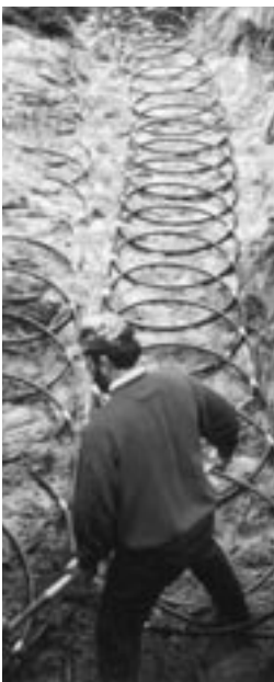
ENERGY CENTER OF WISCONSIN

Onamia Elementary School, located 100 miles north of the Twin Cities in Onamia, Minnesota, is heated and cooled by a geothermal heat pump system. The system cost $50,000 more than a conventional heating system, but when the price of an air conditioner is added in, the system actually costs less. Onamia is one of 16 schools in Minnesota proving that geothermal heat pump systems can handle tough, northern climates. Two new Wisconsin schools in Fond du Lac and Evansville have recently selected the geothermal option.