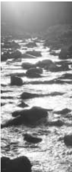
Wisconsin streams are both beautiful and powerful.

Maintenance. Hydro systems generally require less time for operation and maintenance than other renewable energy