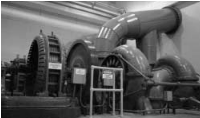
NORTH AMERICAN HYDRO, INC.

Early hydropower technology was more reliable and efficient than emerging fossil fuel technology, and for that reason, many hydropower plants were built on appropriate rivers and streams, usually to serve their immediate areas. But as fossil fuel technologies became fully developed, the trend toward large, centralized power stations began to become established. The hydropower plants that survived tend to duplicate this model. Most people know about Hoover Dam and other large dams that were built to generate enormous amounts of electricity. Unfortunately, although they can be very economical to operate, these gigantic dams are now seen as causing environmental damage.