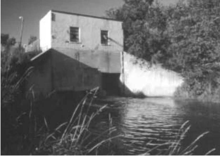
This 20-kW hydropower plant in the Village of Oxford, Wisconsin, sells its power to Alliant Energy.