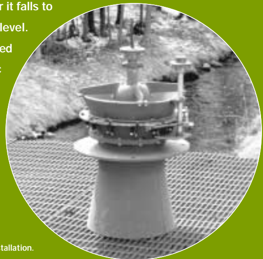
A small, vertical-type microturbine before installation.

The amount of electricity that can be produced depends on the vertical distance downward the water must travel (the hydrostatic head) and the volume of water running through the system (the flow).