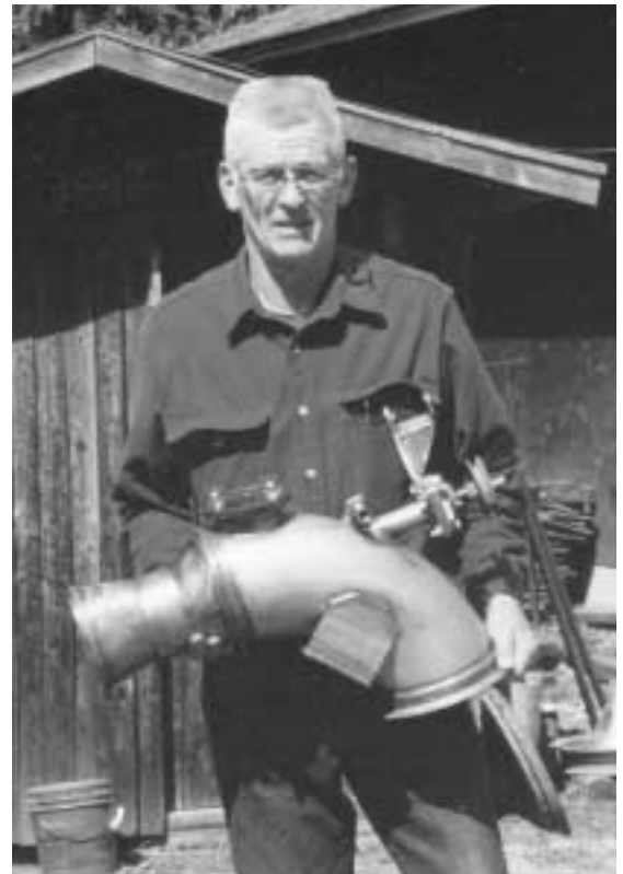
NORTH AMERICAN HYDRO, INC.

Quality design and construction. To ensure a safe and reliable hydroelectric system, consult an experienced designer. Refer to Wisconsin's Renewable Energy Yellow Pages for a listing of Wisconsin's hydroelectric professionals.