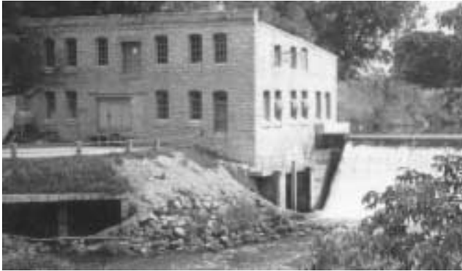
NORTH AMERICAN HYDRO, INC.