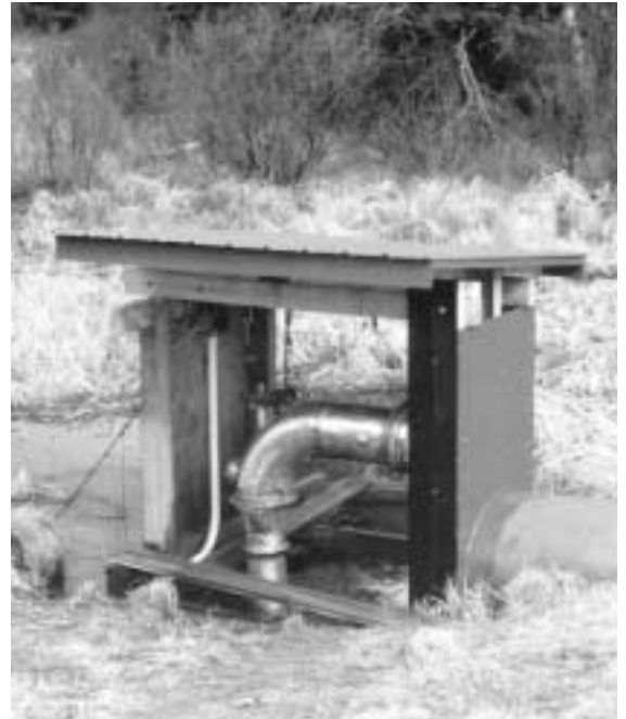
NORTH AMERICAN HYDRO, INC.

Small systems can be designed to supply all electricity needs of a household, small business or industry. Small-scale hydroelectric systems range from 50 watts to 1 megawatt. Less than 20 feet is generally considered low